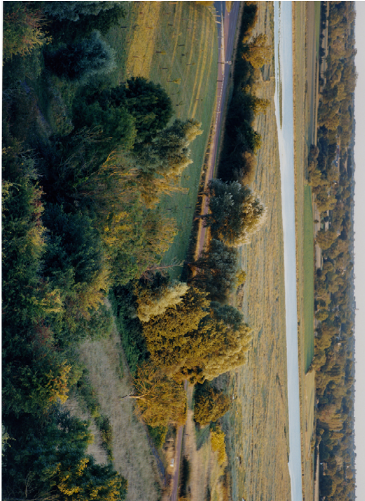
Les Ailes des Mouches