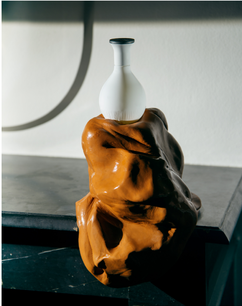
Look Right Look Left