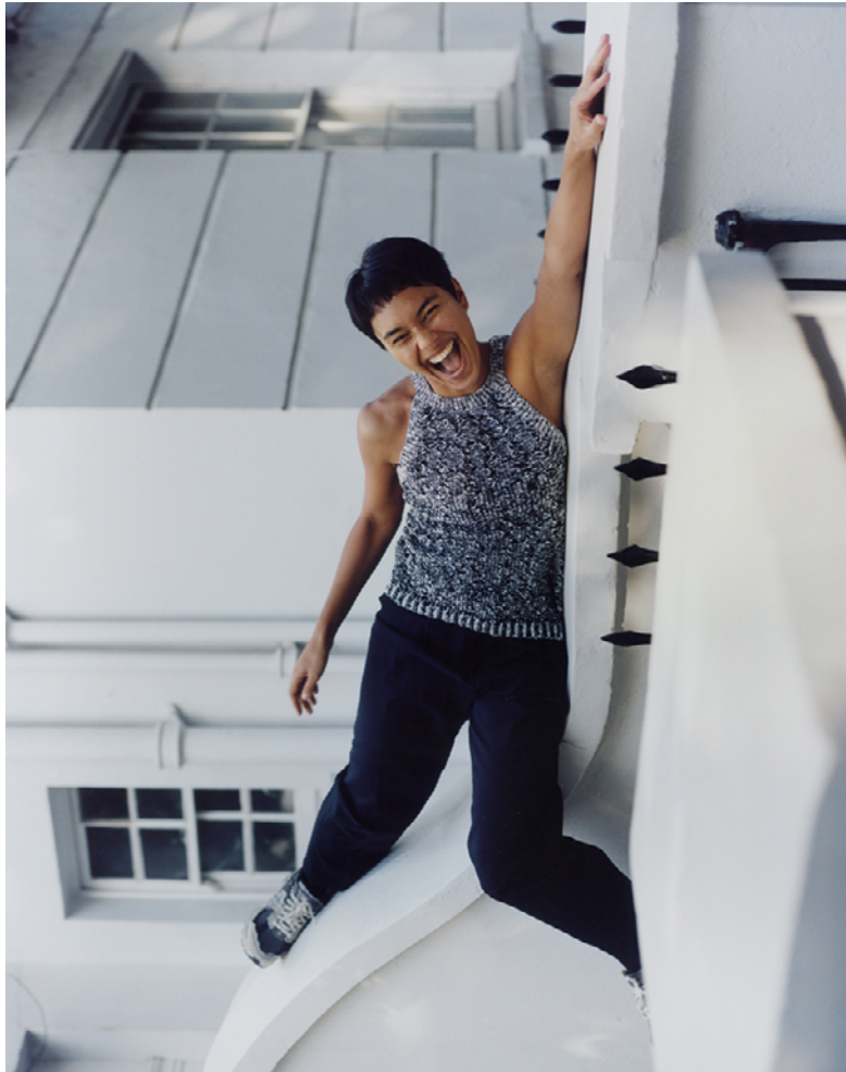
Look Right Look Left